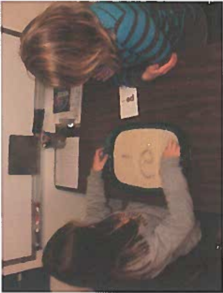
The Children's Dyslexia Centers of Cincinnati Cincinnati & Norwood Campuses