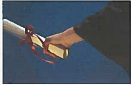
Scholarships for Students attending College