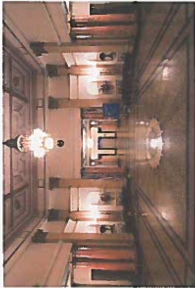
Renovation & Repair of The CMC or other Historic Buildings